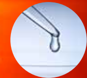
AC-11 Beneficial ingredient extracted from the bark of Cat's Claw Vine

These berries, known to be super fruits, are one of the key ingredients in our product. These five kinds of brightly-coloured berries with refreshing taste grow under adverse conditions, and we combine the extracts from these super fruits to obtain AND's exclusive formula.