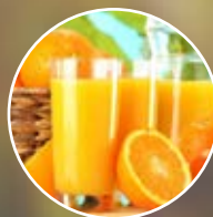
PURIFICAR (Original Flavor)

With its wide range of possible applications, it is so easy to incorporate PURIFICAR into your healthy lifestyle. Try adding PURIFICAR to your favourite recipes today!