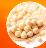
Soy peptides Outstanding ingredient to help you recharge