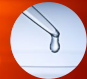
AC-11 Beneficial ingredient extracted from the bark of Cat's Claw Vine

These berries, known to be super fruits, are one of the key ingredients in our product. These five kinds of brightly-coloured berries with refreshing taste grow under adverse conditions, and we combine the extracts from these super fruits to obtain AND's exclusive formula.